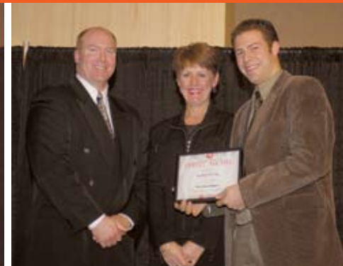
Schmeiser Spirit Award