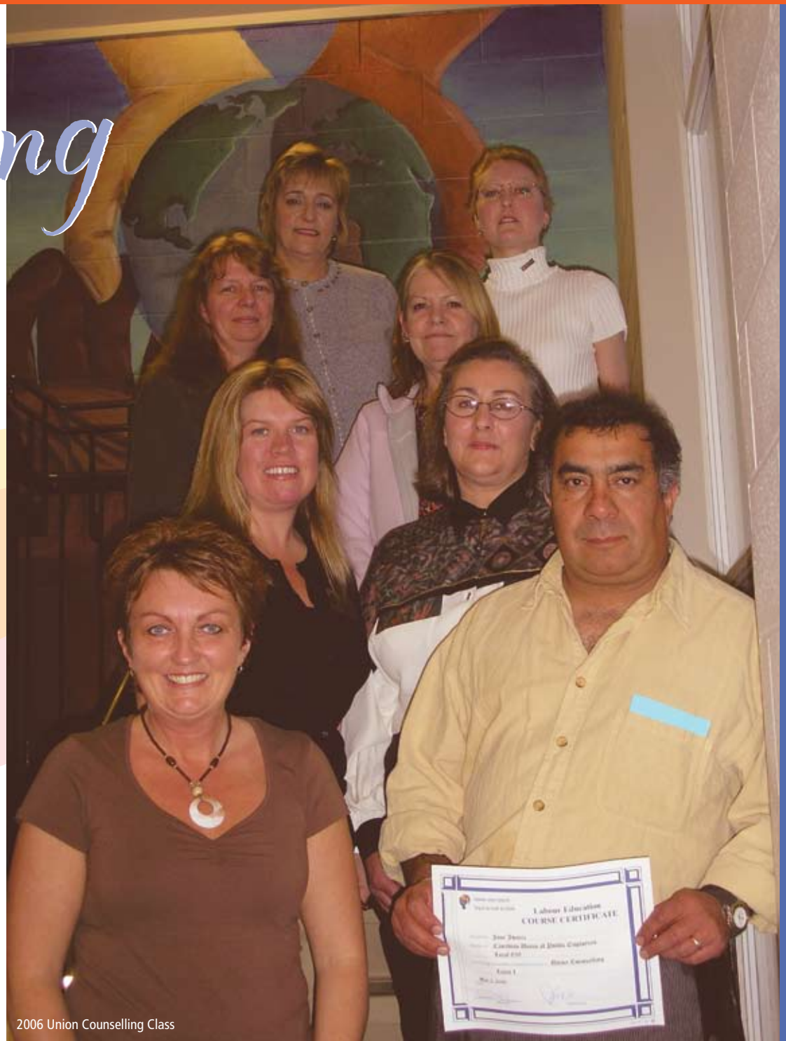
2006 Union Counselling Class

This partnership also brings important leadership to our United Way Community Campaign. Joint union-management campaigns ensure increased campaign results. Through joint-leadership, recognition and celebration, management and unions are working together to have a positive impact on the quality of life in Saskatoon through the annual community campaign.