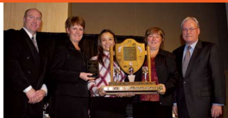
Saskatoon & District Labour Partnership Award