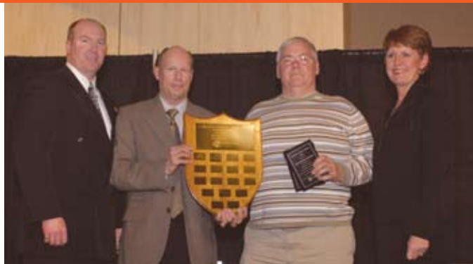
Campaign Chair's Choice Award

Winner: Potash Corp - USW Locals 7458/7689/189