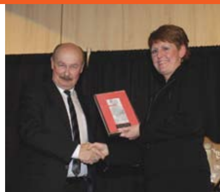
Media Award - The Star Phoenix