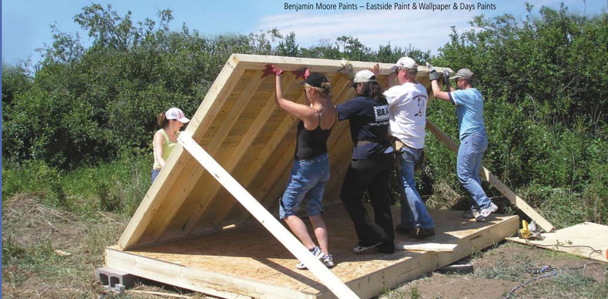
"Help Us Get a Spiffy Biffy" Girl Guides – Women's Council, SRHBA, Northridge Development

Benjamin Moore Paints – Eastside Paint & Wallpaper & Days Paints